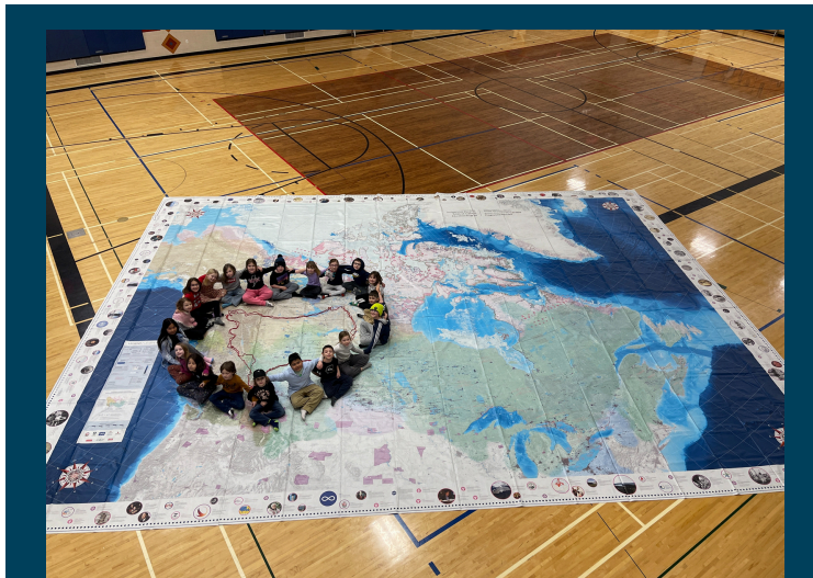
Image: (Top) A floor map of Turtle Island with Treaty delineations is one of many interactive teaching tools. GPPSD students are posed surrounding Treaty 8. (Bottom) Krista teaching traditional beading, a form of coding.

The Board thanked Krista for her dedication to students and for guiding the division's Reconciliation journey. Read more about this incredible achievement here .